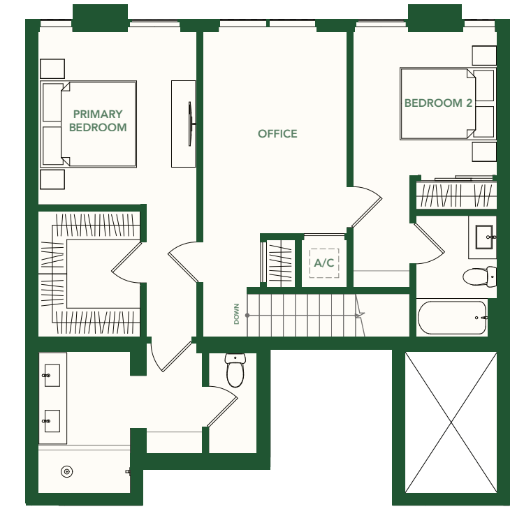
SECOND LEVEL Interior - 894 SF / 83 M<sup>2</sup>